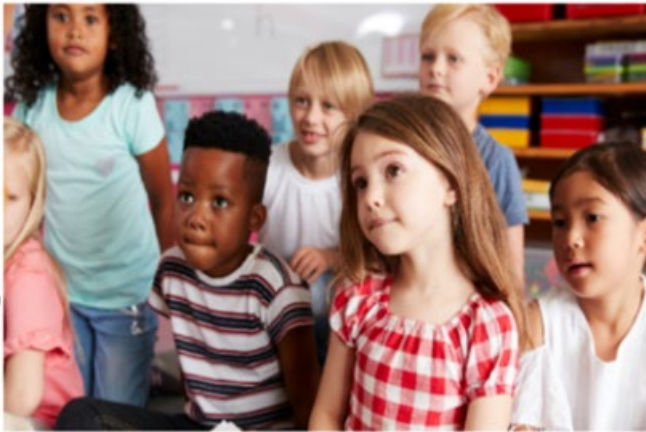
Building a Strong Foundation for Lifelong Literacy Success