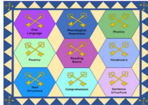
Keys to Beginning Reading

Both trainings are approved to meet the READ Act teacher training requirements for all teachers