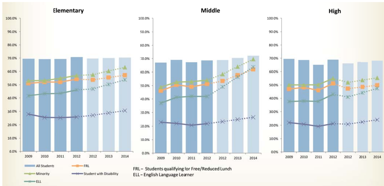
Chart #1: Achievement for ELLs Compared to Other Subgroups of Students

As noted above, Colorado has made gains in improving outcomes for ELL students relative to other subgroups of students, as shown in Chart #1 below. The lines reflect the performance of subgroups of Colorado’s students. The bars reflect CDE’s performance targets for achievement by year.