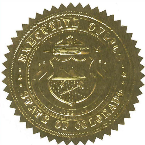
Jared Polis Governor