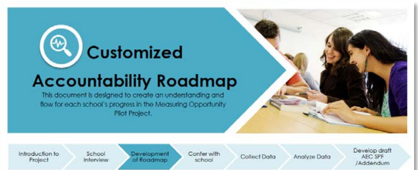
Artifact 3 from MOPP: Picture of Customized Accountability Roadmap Portal